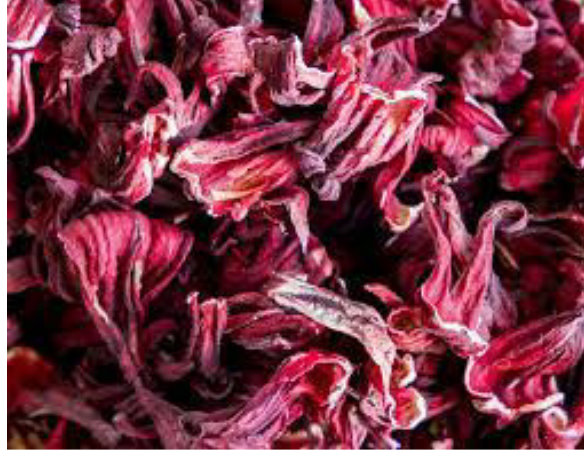
Figure 1. Dry Zobo ( Hibiscus sabdariffa ) Leaves (Onabanjo and Airaodion, 2022)

elements or minerals (Ozcan, 2003). Minerals are divided into macro (major) and micro (trace) elements. The ultratrace elements are the third group. Calcium, phosphorus, sodium, and chlorine are macrominerals, while iron, copper, cobalt, potassium, magnesium, iodine, zinc, manganese, molybdenum, fluoride, chromium, and sulphur are microminerals (Eruvbetine, 2003).