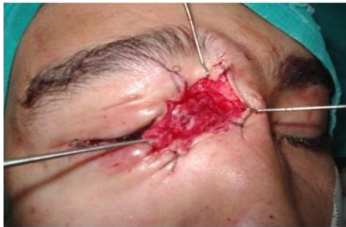
Figure 2. The destroyed MCT which is replaced by fibrous tissue.