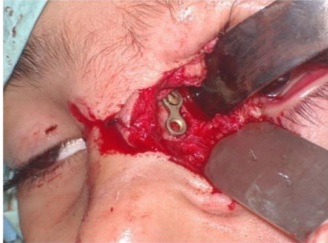
Figure 6. The plate is fixed by screw through the upper hole, the screw should not be completely tightened.