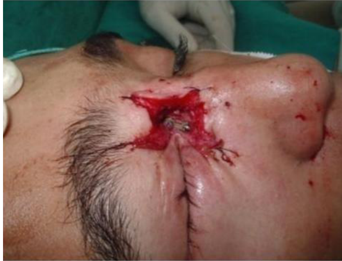
Figure 4. Fibrous tissue attached to MCT inserted beneath the plate from the posterior border.