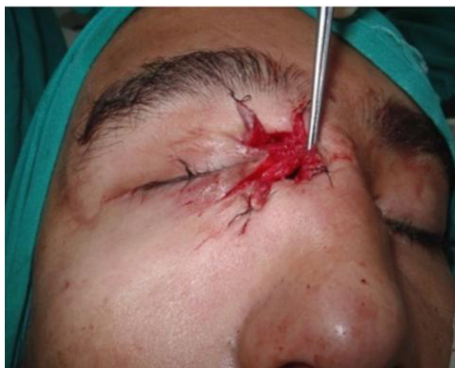
Figure 3. Fibrous tissue in continuity with MCT