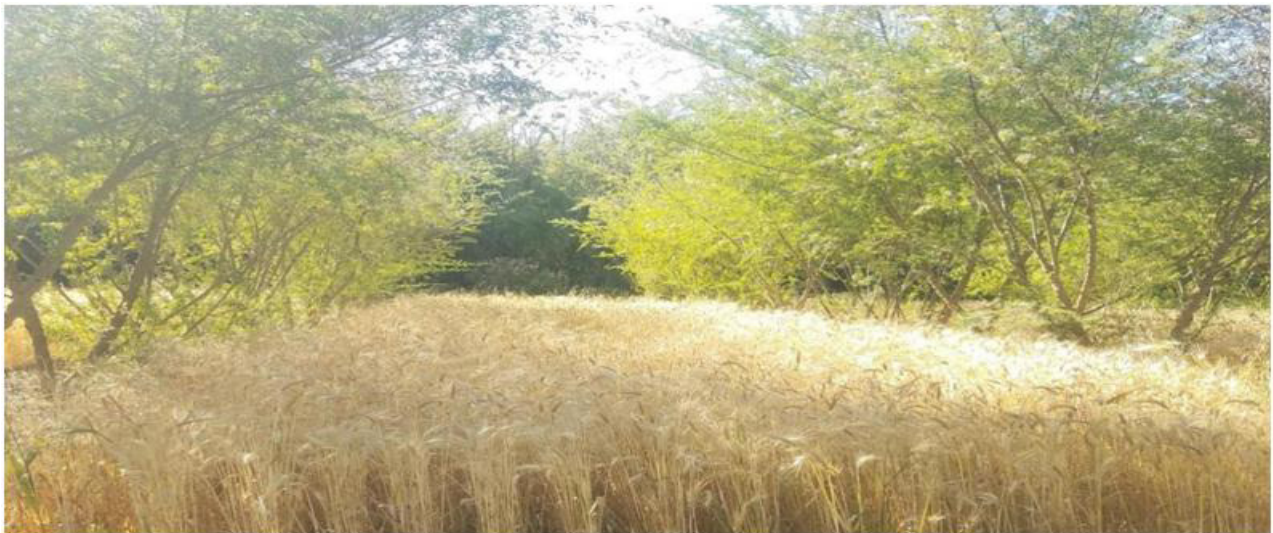
Figure 2. Performance of wheat Alley cropping agroforestry system at maturity stage

*Mean values in the same column with the same superscript are not significantly different, Mean values in the same column with different superscript are significantly different, NSPS= Number of Seed per spike, TKW=Thousand Kernel Weight, TGY/Ha=Total Grain Yield per Hectare