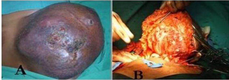
Figure 1A. Rt breast pre-operative